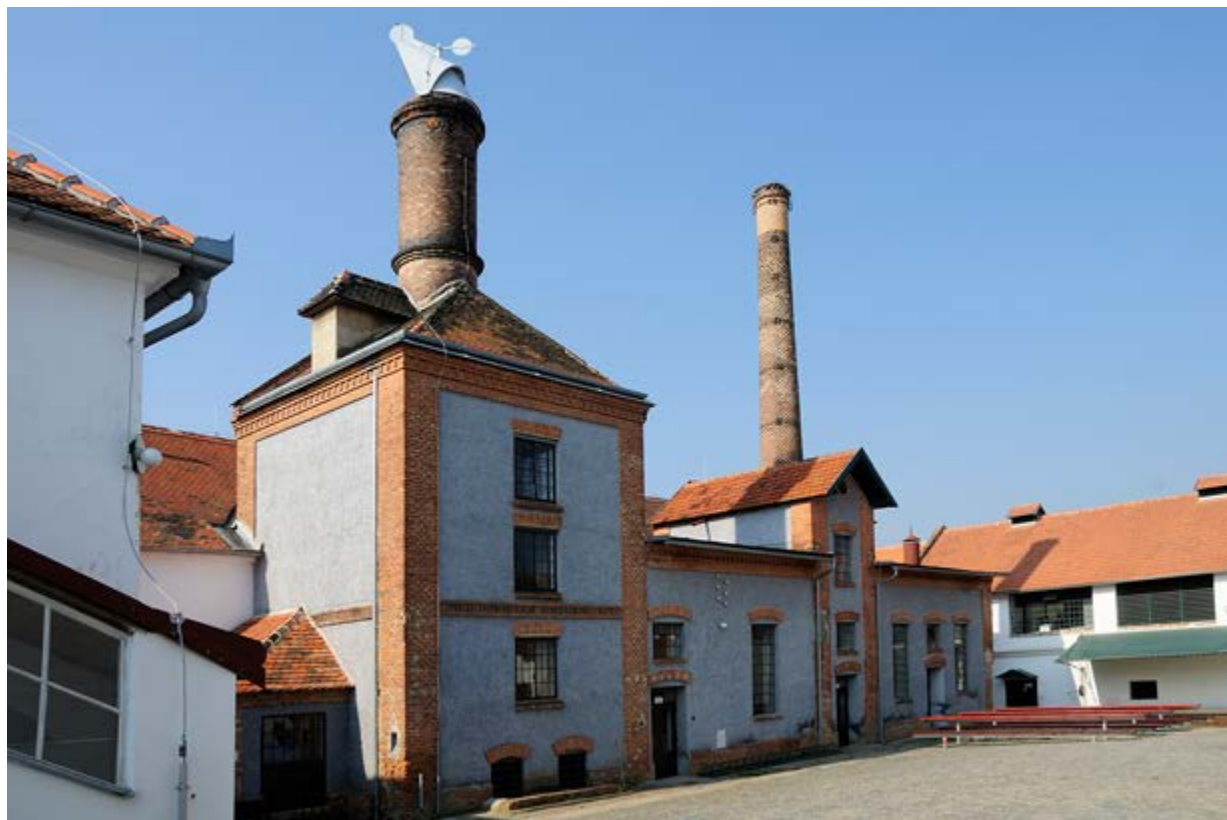
Dalešice Brewery Dalešice 71, 675 54 Dalešice, Czech Republic https://www.pivovar-dalesice.cz/